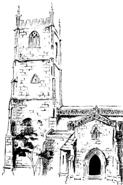
St George, Cam

(Churches within the Church of England, Gloucester Diocese)